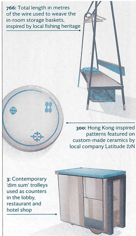
766: Total length in metres of the wire used to weave the in-room storage baskets, inspired by local fishing heritage