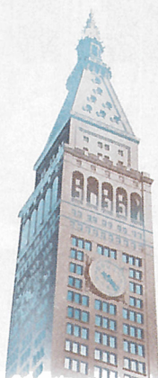
4: Clock faces, one on each side of the Met Life Clock Tower, which now houses the New York Edition. Each minute hand weighs half a tonne and each face measures 26.5ft in diameter